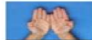
varenyam we venerate