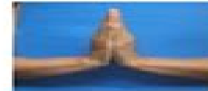
prachodayat to inspire us

Om, body mind and spirit (that are expressions of) That Sun God (consciousness) That we venerate May that divine light which we meditate upon Inspire our vision and energy.