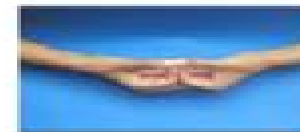
dimahi we meditate on