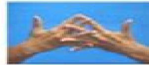
bhuvah mind sky