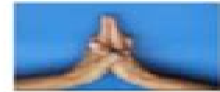
swaha spirit heaven