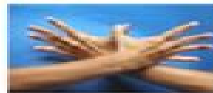
yo nah intellect